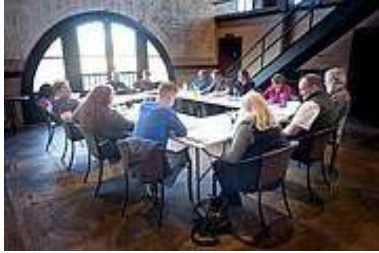
A rehearsal of ‘A Gay SDA Play’ at The Power House Theater, where the play took the stage.

painful things, and some of those make it into the play and some of those don’t.”